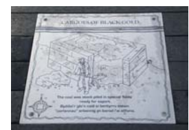
Close up of picnic bench plaque

century; picnic benches at Cresswell Quay depicting a story of a village from where coal was exported for over 700 years; an interpretation panel at Burnett's Hill Chapel revealing the difficult conditions miners had to work in. Amroth and Colby woodland garden also benefited from this project with interpretation boards telling a story of Amroth's industrial past.