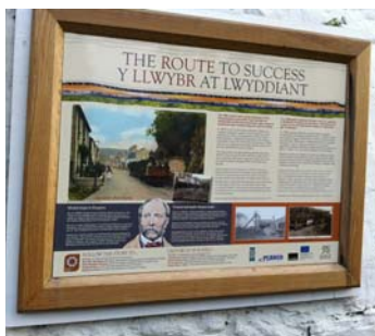
Panel at Saundersfoot

commissioned. As part of the first stage Letha Consultancy developed an interpretation plan to tell the industrial heritage story of Saundersfoot and Kilgetty area. The plan identified unique stories and themes linked to