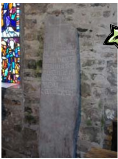
The Caldey Island Ogham stone