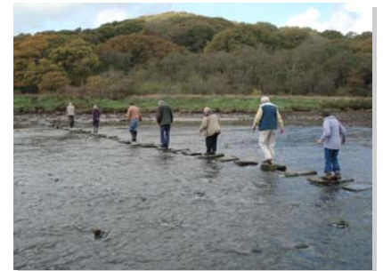
PLANED's photographic entry of the Industrial Past group at Cresswell Quay

by 121 different enterprises and were whittled down to the best twelve. The twelve finalists make up a calendar and the photographers attended a training session in London where the winner was also announced. Unfortunately we didn't win first prize but there is always next year!