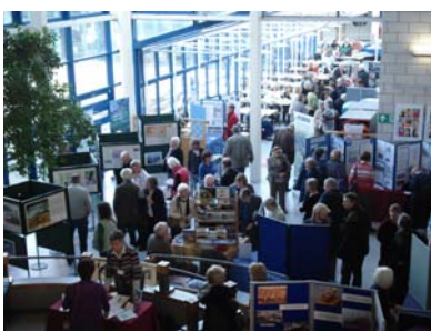
Some of the exhibits at Pembrokeshire College