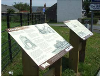
Panels at Lamphey

The community of Lamphey was very pleased with two beautifully illustrated panels with drawings by local artist Geoff Scott. The historical information