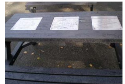
Picnic bench at Cresswell Quay

Interpretation panels in Saundersfoot telling the story of a thriving coal harbour servicing the industrial boom of the 19 th