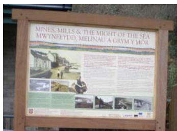
Panel at Amroth

To build on the findings of the audit a 2-stage interpretation project for the area was