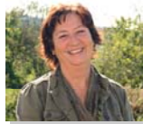
Sarah Diment Community Tourism

These projects are funded through the Rural Development Plan for Wales 2007-2013 which is funded by the Welsh Government and the European Agricultural Fund for Rural Development.